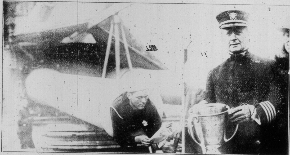
THE DAUGHTERS OF 1812 INTERRUPTED UNCLE SAM'S FRENZIED PREPARATIONS FOR WAR TO PRESENT A LOVING CUP TO THE "NEW YORK'S" COMMANDER—AT THE LEFT OF THE PHOTO IS A HUMAN SHELL READING THE LATEST WAR DEVELOPMENTS.