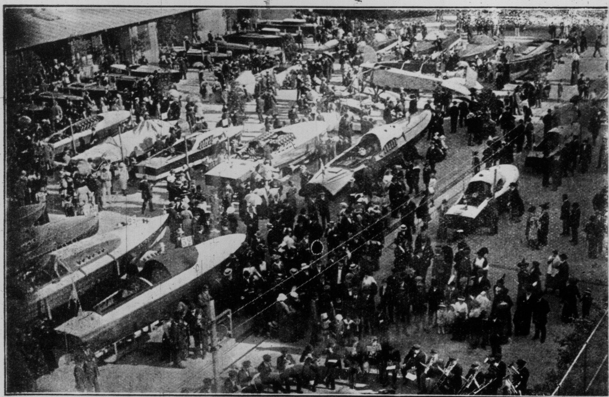
"SPEEDIEST CRAFT IN EUROPE EXHIBITED AT MONACO, PREVIOUS TO THE MOTORBOAT RACING FOR OLD WORLD CHAMPIONSHIPS.