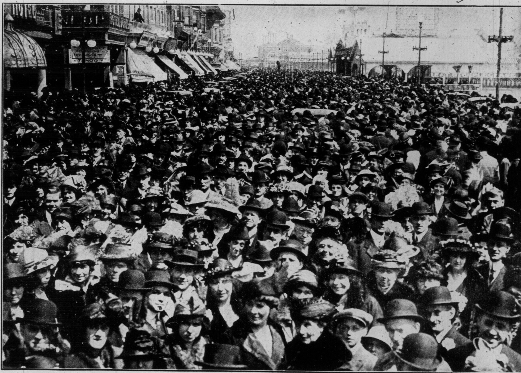
CROWD OF 125,000 JAMS ATLANTIC CITY'S BOARDWALK ON EASTER SUNDAY