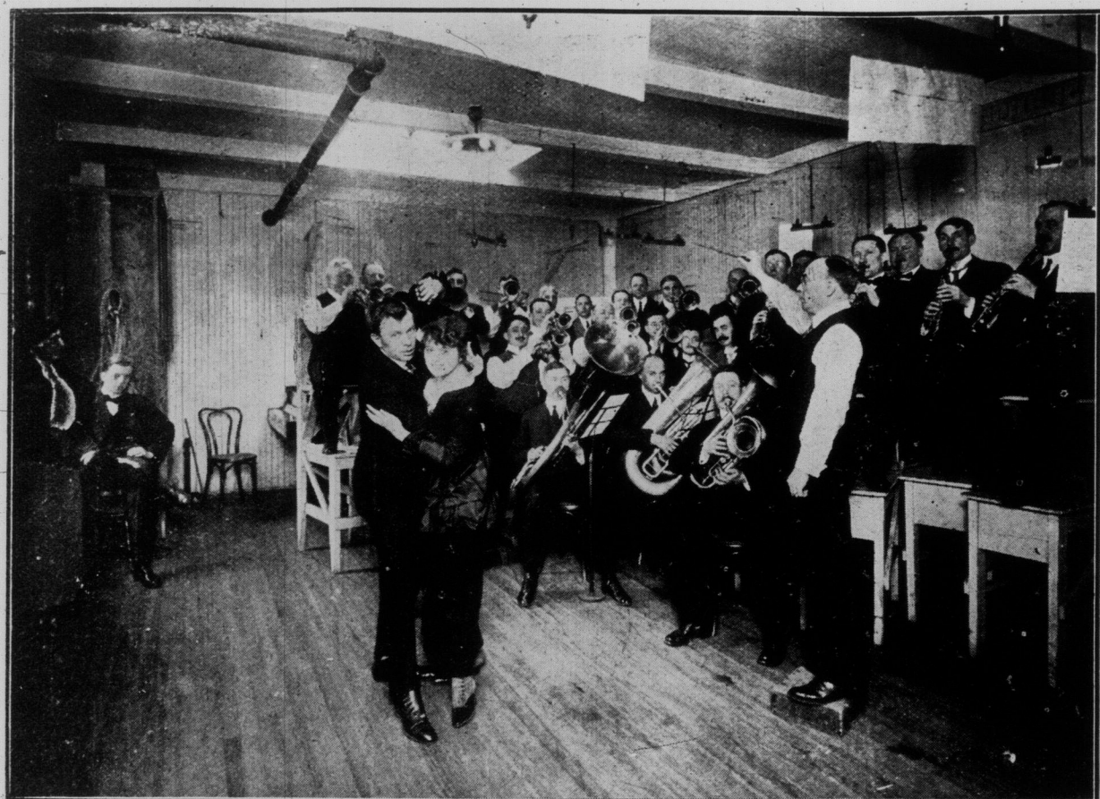
WITH A COUPLE TANGOING BEFORE HIM, THE CONDUCTOR OF A BAND MAKING PHONOGRAPH DANCING RECORDS IS ABLE TO GET THE PROPER TEMPO—NOTICE THE CURIOUS CHAIRS, WHICH ARE USED FOR GETTING THE PROPER TONE EFFECT INTO THE HORN.