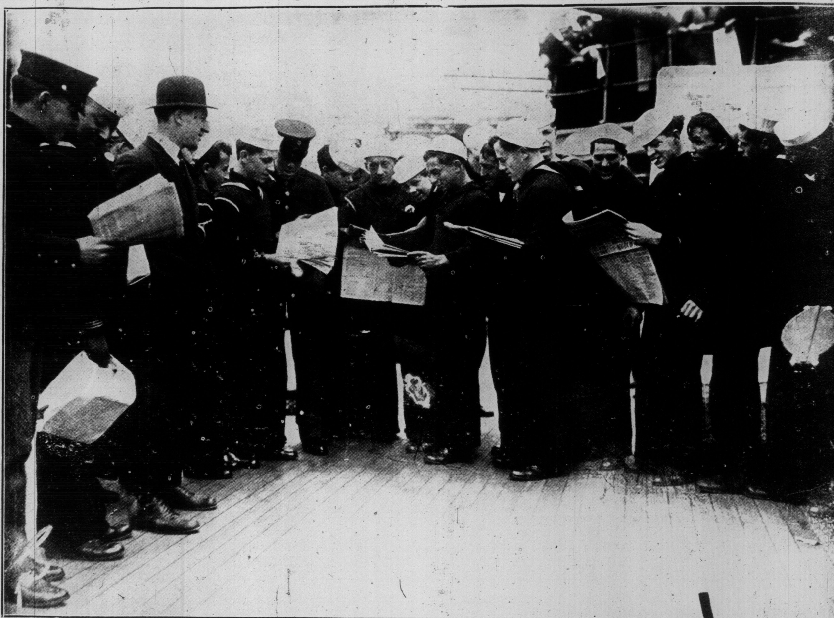
SAILORS ON BOARD THE "LOUISIANA" READING THE LATEST NEWS AS THEY SAIL FOR MEXICO, TO BACK UP THE AMERICAN PRESIDENT'S ULTIMATUM.