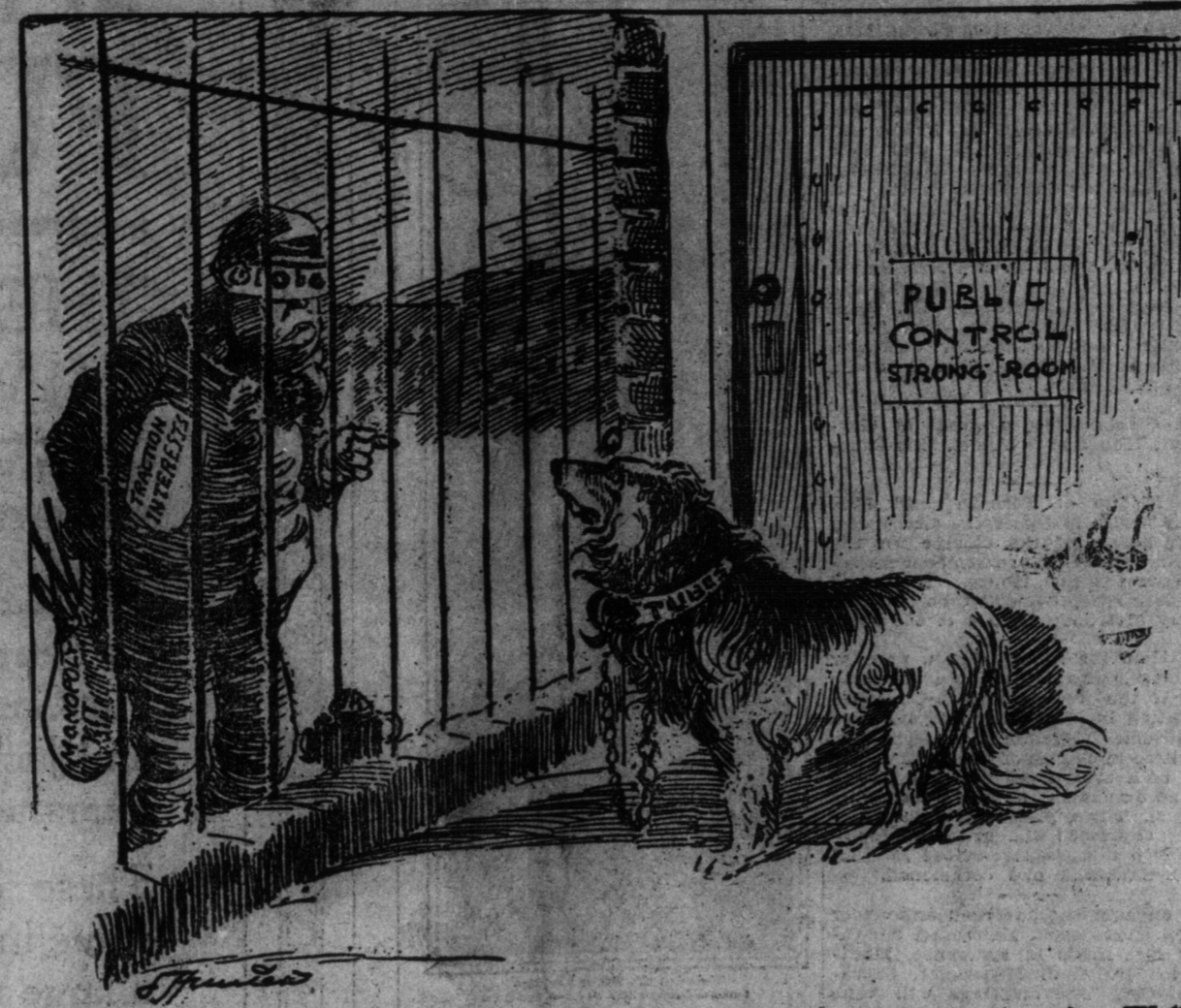
PARTY IN MASK (to watchdog): "You'd keep me out, would you? Well, I'll start a red hot mad dog scare agin you."