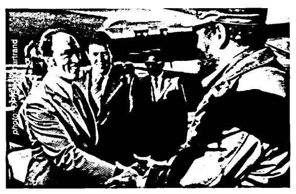
Pierre Trudeau visits Havana in 1976.