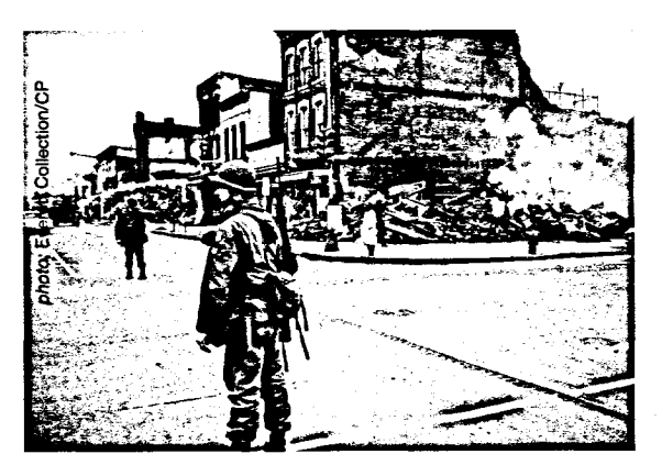
Army patrols follow the King assassination in 1968.