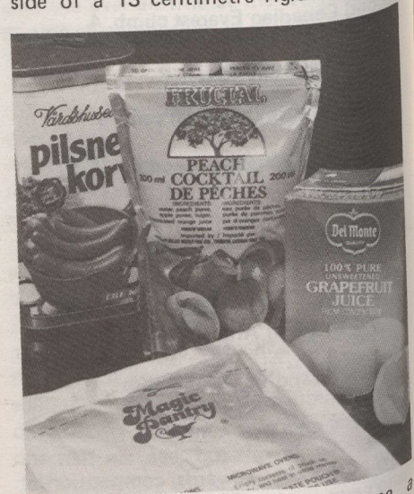
Aluminum packaging has become a household staple.

One of the devices feeding data into computers in a growing number of offices throughout the world is the rigid memory disc, made of aluminum, produced by Alcan's affiliated company in Japan. One side of a 13 centimetre rigid aluminum