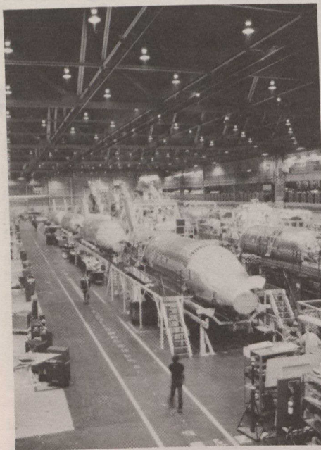
Today's jetliners are the product of a generation of refinement in the design of aluminum airframes.

For food preservation and preparation, aluminum foil is rapidly expanding its