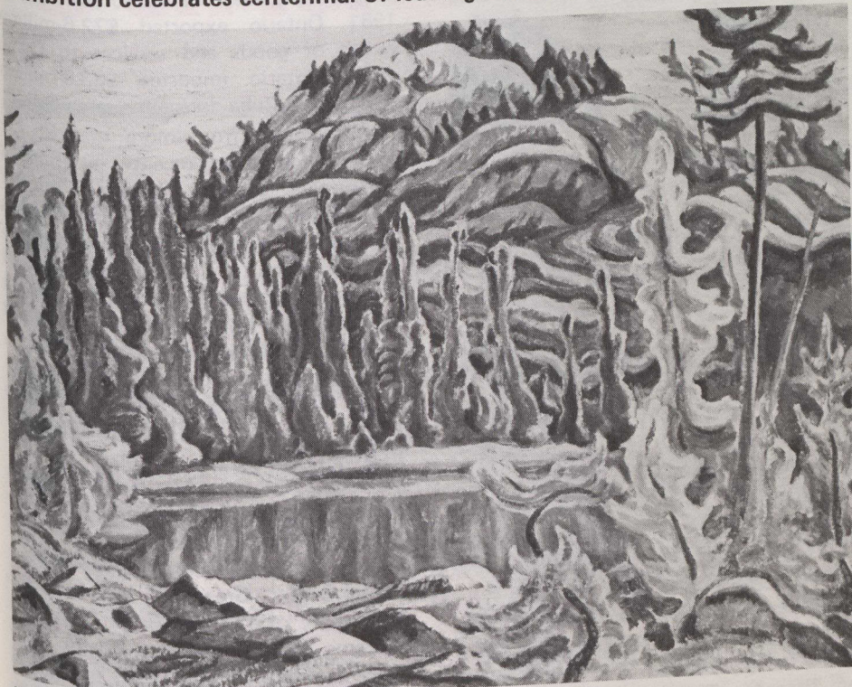
Partial view of Sunlit Tapestry 1939 by A. Y. Jackson.

The National Gallery of Canada in Ottawa will commemorate the one-hundredth birthday of one of the key figures in Canadian art, Alexander Young Jackson.