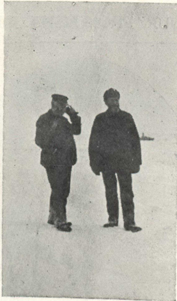
The Captains consulting—boats ice-bound

Of the cap- the steamers that in the exacting con- spite of much they have sh- are the only derstand the