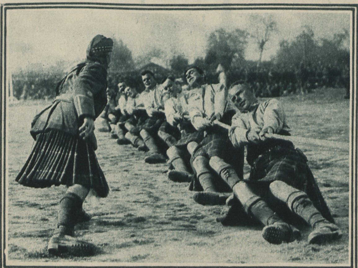
Hefty though they were, these Canadian "Kilties" did not win.