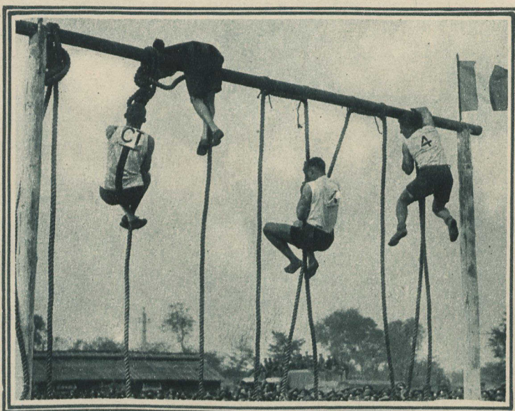
One of the joyous little "snags" in the obstacle race.