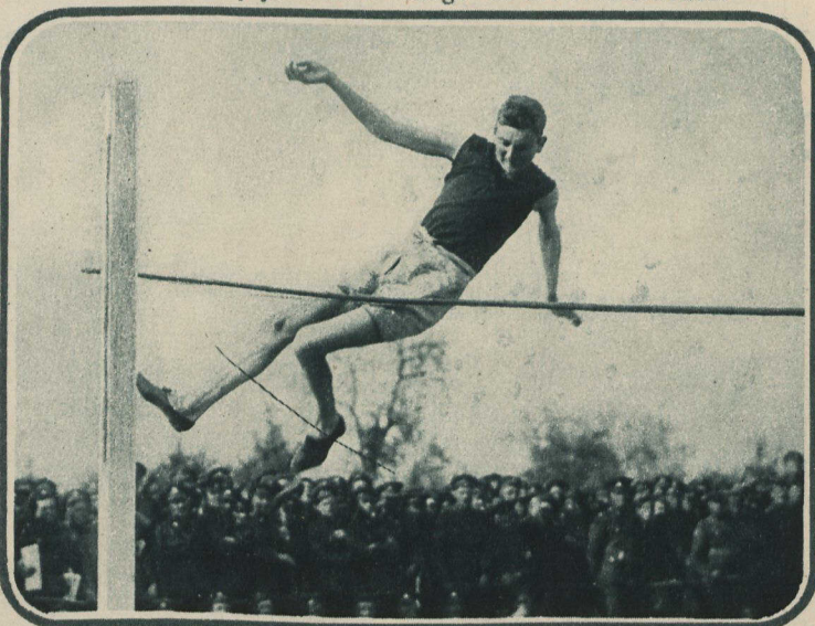
A popular soldier known as "Blim" wins the high jump.