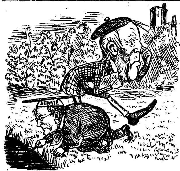
AN EVIL SMELL IN THE QUEEN'S PARK. (Dedicated to the University Senate.)