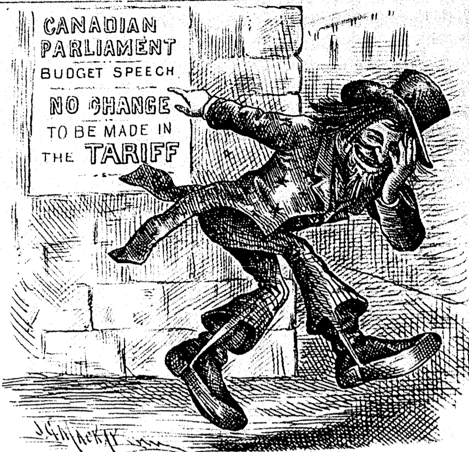
BROTHER JONATHAN JUMPING WITH JOY AT THE PROSPECT OF KEEPING THE CANADIAN MARKET.

CANADIAN PARLIAMENT BUDGET SPEECH NO CHANGE TO BE MADE IN THE TARIFF