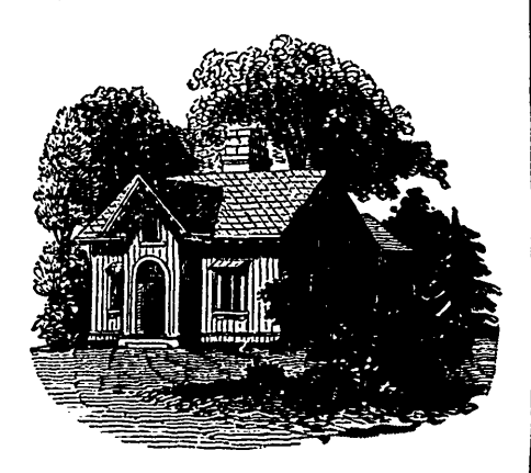
DESIGN FOR A COTTAGE.

SHORTENING-BACK IN TRANSPLANTING .-The Horticulturist states that an orchardist on the Hudson tried an experiment by planting out 78 peach trees of large size, three years growth from the bud. One half were headed back so as to reduce the buds onehalf; the rest were unpruned. The season was dry, and twelve of the 3° unpruned trees, perished, and only one of those that were This one would probably headed back. have survived, had three-fourths instead of one-half of the buds been removed.