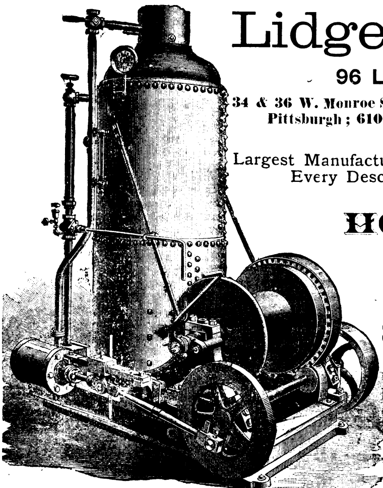
Friction Drum Portable Hoisting Engine.