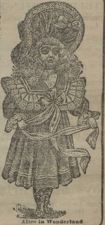
Alice in Wonderland

This lovely pair of twin sister dolls, Cinderella and Alice in Wonderland, are the new arrivals from far away doll-land, and are real beauties, nearly one and one-half feet tall. Cinderella is the new wonder blonde doll, with bisque head, curly hair, lace-trimmed dress, hat, ribbon sash, etc. Alice in Wonderland is a handsome brunette beauty doll, with dark curly ringlets, bisque head, lace-trimmed dress, hat, shoes, stockings, etc., complete. Girls, would you like to own Cinderella and Alice in Wonderland, the pretty twin sister dolls, for a little pleasant work or school hours? If so, write us at once and we will mail to your address, postage paid, sixteen turnover collars, handsomely made of fine quality lawn and lace, to sell at 15c each. They are the latest fashion in neckwear and sell at sight. When sold return us the money and we will promptly forward you this handsome pair of twin sister dolls, also a beautiful Opal Ring as an extra present if you write to us at once. If, however, you will receive the two dolls, Cinderella and Alice in Wonderland, for disposing of only sixteen collars at 15c each. The Home Art Co., Dept. 433 Toronto.