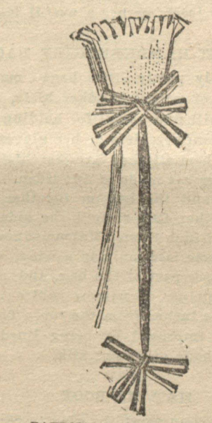
PATRICTIC BROOM PENWIPER.

The pen wiper always bobs up serenely at Christmas time as an inexpensive souvenir. It is an excellent substitute for the useless Christmas card. A new idea for a penwiper is the patriotic little broom. It is easily made, and attractive as well as serviceable when finished. The handle of the broom may be made of a pencil or even a stick whittled to the proper thinness. Wind in lattice-like fashion around the