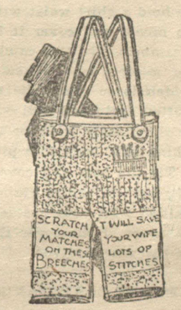
A FUNNY LITITLE MATCH SAFE.

sists of a pair of tiny blue denim overalls. They have pearl buttons, and suspenders made of bone casing, and a big pocket in each leg to hold the matches. Below the