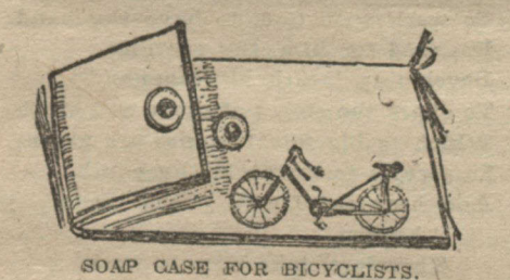
board covered with linen. A tiny bicycle is embroidered on the cover, and the case fastens with a patent clasp, like a glove clasp. The soap sheets are sewed inside the case.

A useful and inexpensive little Christmas gift suitable for a bicyclist is a small linen case for holding antiseptic soap It is made of two pieces of cardsheets.