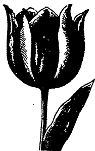
FIG. 1.—DUC VAN THOL TULIP.

The earliest varieties will usually be in bloom in the last days of April, and by planting the sorts that come later, a succession of bloom can be kept up until the first of June. The Duc Van Thol tulips (Fig. 1), are the first to bloom.