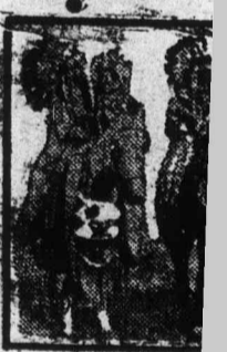
1. Indians, g of peace—to th

THE Indian, th is ever ready to the pale face is a 1 than not, he takes appreciation and honor the white m of one of their own, circles.