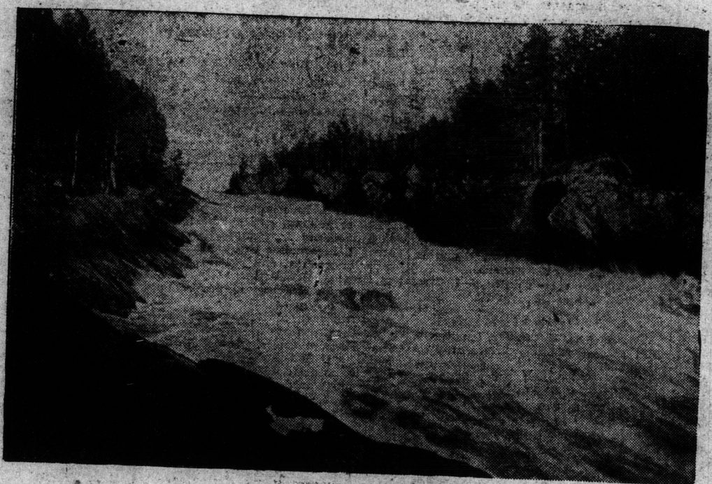
Imatra, above the Rapids

Scarcely less beautiful is the Kangasala ridge north of the town of Tammerfors, "the Manchester of Finland." This also lies between lakes celebrated in song by Finnish