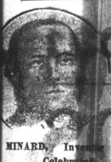
MINARD, Inventor Celebrated

present there is a difference between Norway and over Norway's export of alcohol, and as a result the merchants have cancelled the loss of some millions to Norwegian. A new treaty have been some time but Norway way, as Portugal is a way import of alcohol, and wines, port and brandy in return for the high rate. According to the Ministry of law, strong measures only in drug stores in a description. In this way, 150,000 quarts can be a year. Prohibition is but a majority of the have expressed their of lifting the ban on