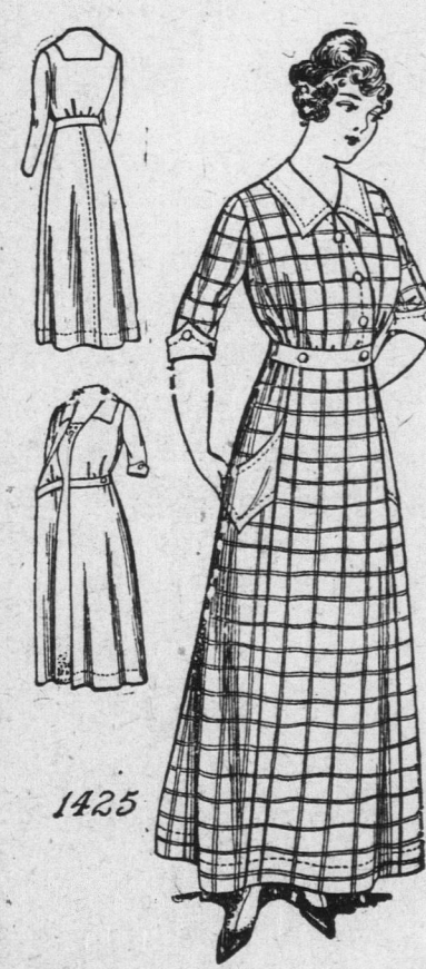
Ladies House Dress With Long or Short Sleeve.

For utility, comfort and convenience, this design has much to commend it. It closes in coat style, with the entire fronts overlapping. This assures easy and practical adjustment. An ample pocket is arranged over the side front. The waist is finished with a neat collar, and with cuffs for sleeve in short length. The long sleeve is dart fitted. The dart fulness may be cut away and the opening thus made, be finished with a facing and underlap for buttons and buttonholes or other fasteners: these the sleeve may be turned back over the arm when desired. The Pattern is good for gingham, percale, lawn, seersucker, soisette, madras, dimity, drill or flannel. It is cut in 7 Sizes: 32, 34, 36, 38, 40, 42 and 44 inches bust measure. It requires 6½ yards of 36 inch material for a 36 inch size. A pattern of this illustration mailed to any address on receipt of 10c. in silver or stamps.