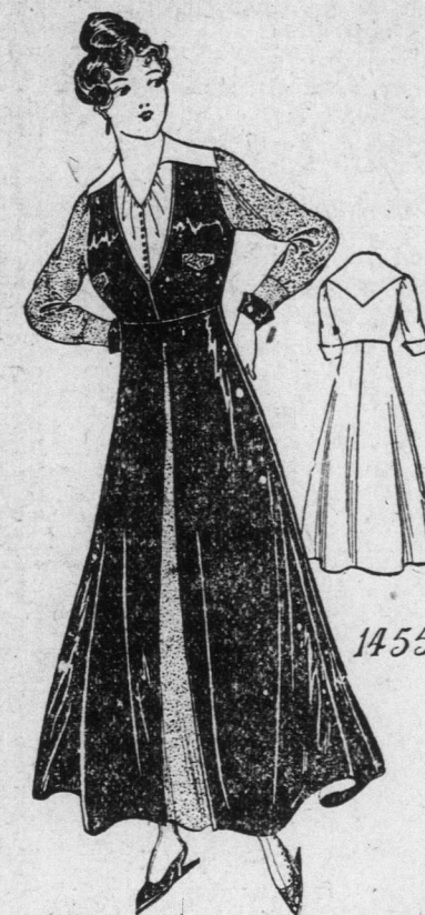
Ladies Dress in Raised or Normal Waistline with Sleeve in Either of Two Lengths.

As here shown, black velvet was used, with dotted net for the sleeves and insert and white crepe for the chemise and collar. The design may be finished with short sleeves. The design is nice for taffeta, faille, serge, gabardine or poplin and lends itself nicely to combination of materials. In green satin with ecru crepe for contrast this model will be very attractive. It is also nice in white or other color taffeta, with batiste, net or lace for trimming. The Pattern is cut in 6 Sizes: 34, 36, 38, 40, 42 and 44 inches bust measure. It requires 6½ yards of 36 inch material for a 36 inch size. The skirt measures about 3½ yards at the foot. A pattern of this illustration mailed to any address on receipt of 10c. in silver or stamps.