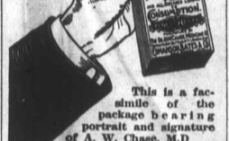
This is a facsimile of the package bearing portrait and signature of A. W. Chase, M.D.

But Imitations Only Disappoint. There are many imitations of this great treatment for coughs, colds, croup, bronchitis, and whooping cough. They usually have some sale on the merits of the original, but it should be remembered that they are like it in name only.