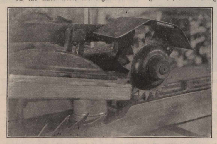
Fig. 3.—Protection to Star Feeder on Rip Saw.

"2. Be on the alert to discover unsafe conditions or practices. When you observe, or anyone reports to you, any condition of way, track, structures, equipment, tools or appliances, or any method of practice, which in your opinion, or the opinion of the one making the report to you, is unsafe and which can reasonably be made safe, make at once accurate and complete memoranda of the particular condition or method observed or reported and also of what you, or the one making the report, may think should be done. Report such conditions or practices as soon as discovered to the proper person for correction, and make full report to the committee.