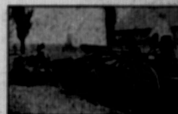
12 H. P. at drawbar—plenty for road work, hauling manure, spreading or any like job

THE CLEVELAND TRACTOR COMPANY Dept. BO, Cleveland, Ohio