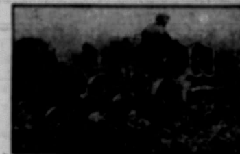
Plows 8 to 10 acres a day—the work of three 3-horse teams and 3 men

THE CLEVELAND TRACTOR COMPANY, Cleveland, Ohio, U.S.A.