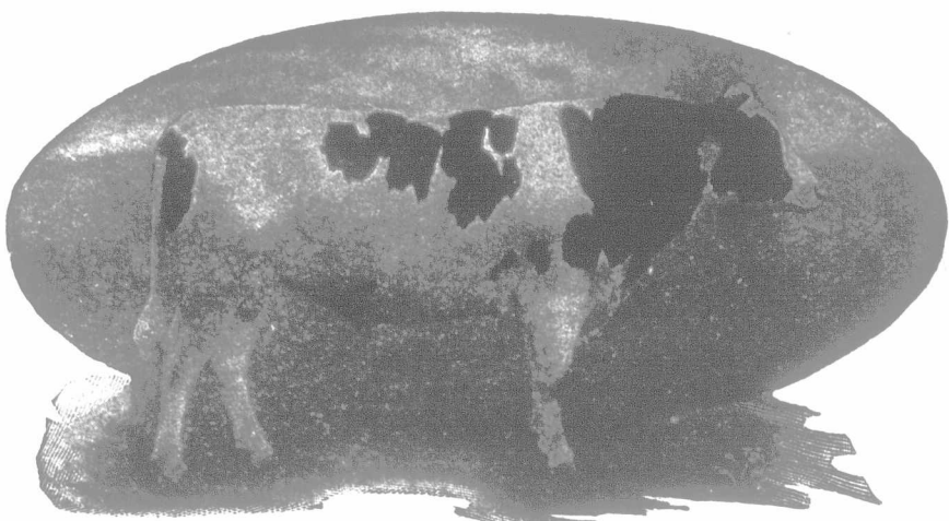
KING SEGIS PONTIAC POSCH—Senior Sire in service at Manor Farm. Sire—King Segis Pontiac Alcartra (the $50,000 sire). Dam—Fairmont Netherland Posch, 32.59 lbs., 4 years old.

2. We doubt the advisability of seeding down somewhat impoverished weedy land that is spring plowed. If the weather set in dry the small seeds would have no chance. We believe you would have more satisfactory results by endeavoring to clean the land a little and possibly incorporate some humus in the form of manure, or plowing under a green crop before sowing grass seed.