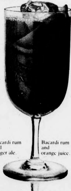
Bacardi rum and orange juice.

BACARDI RUM IS PRODUCED BY SPECIAL AUTHORITY AND UNDER THE SUPERVISION OF BACARDI & COMPANY LIMITED. BACARDI AND BACARDI DEVICE ARE REGISTERED TRADE MARKS OF BACARDI & COMPANY LIMITED. BOTTLED BY F&M DISTILLERY CO. LTD. CANADA