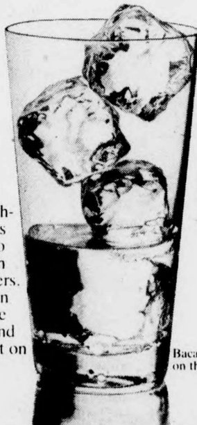
Bacardi rum on the rocks.

Bacardi is beautiful by itself. Clean. Light. Smooth-tasting. That's why it goes so smoothly with so many mixers. Add your own favourite taste to Bacardi, and you can count on enjoying it.