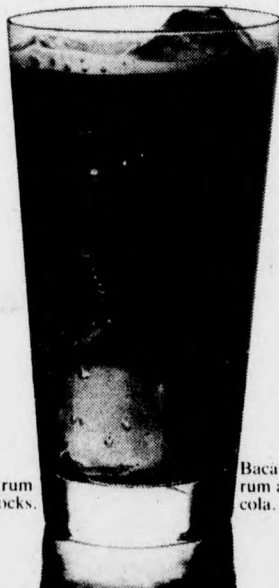
Bacardi rum and cola.