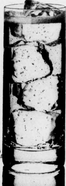
Bacardi rum and ginger ale.