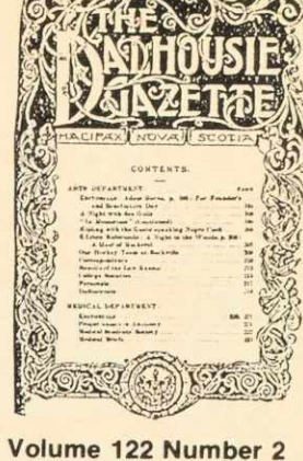
Volume 122 Number 2 Sept. 14 1989

(Editor's Note: Please make sure all your letters to the editor are typed and double-spaced. Two letters this week, including this one, came to us handwritten, and to be kind, we typed them out. Never again; you are hereby warned.)