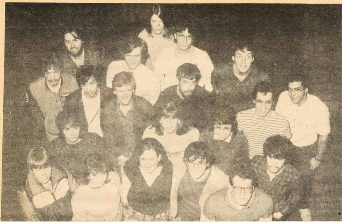
Things are looking up at the Gazette, but oh gosh, horror of horrors, wouldn't cha know it, the year comes to an end. Pictured above (or below, depending on your point of view) are some of the survivors of this year's staff. As Bobbie Vinton once said, See you in September.