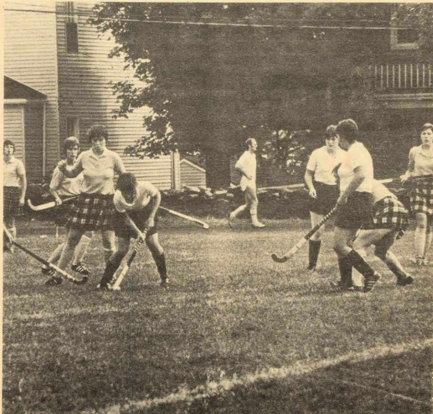
The Dalhousie Women's Field Hockey team has done quite well over the years.

The Gazette will publish the dates of tournaments and games together with their results in future issues.