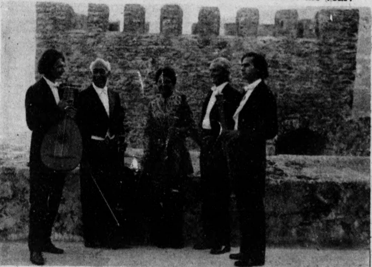
Ars Antiqua de Paris

Organized in 1965, the Ars Antiqua de Paris has participated in many major music festivals. The group toured the Scandinavian countries in November and is making its fourth visit to the U.S. and Canada this year. In May they leave for South America and the Caribbean Islands and will be in Japan at the end of the year.