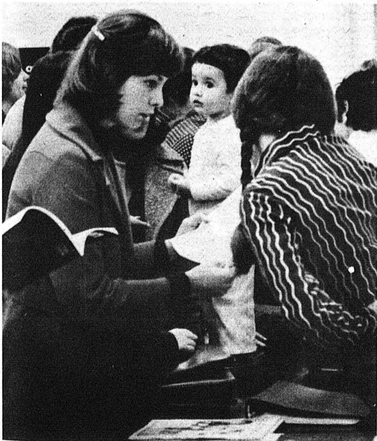
Organising against a sluggish and backward group of male bureaucrats.

The Native Women's workshop sent a special letter to Syncrude Canada which called for the company to grant women and natives special, preferential treatment in job training, employment, wages, and other involvements of the company. This workshop also called on Canada Manpower to train women for jobs opening up in Alberta that have traditionally been held by males.