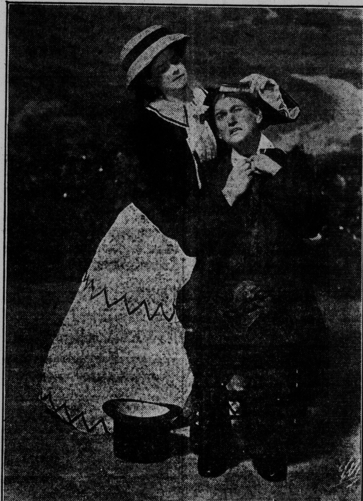
BUNTY AND WILLUM IN "BUNTY PULLS THE STRINGS"

Special Company of Scotch Players Coming to The Opera House Next Monday for Four Nights