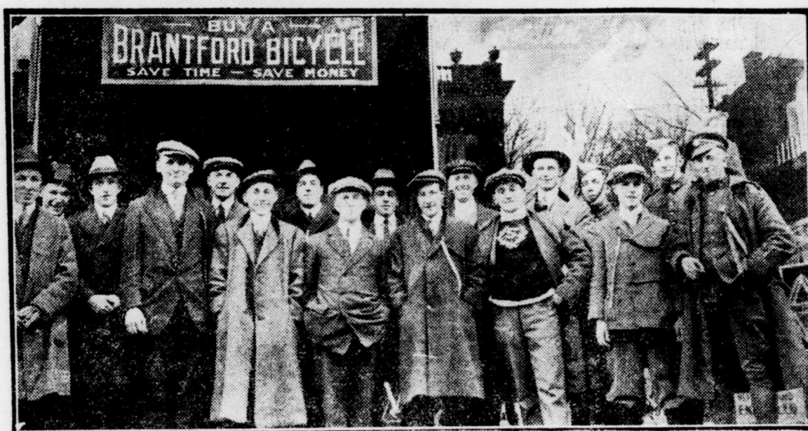
TORONTO BICYCLE MEN, among whom are several champions, who came here to participate in the big bicycle meet on May 24. The boys returned home disappointed, but promised to return for the races at Queen's Park tomorrow. The meet promises to be a huge success.