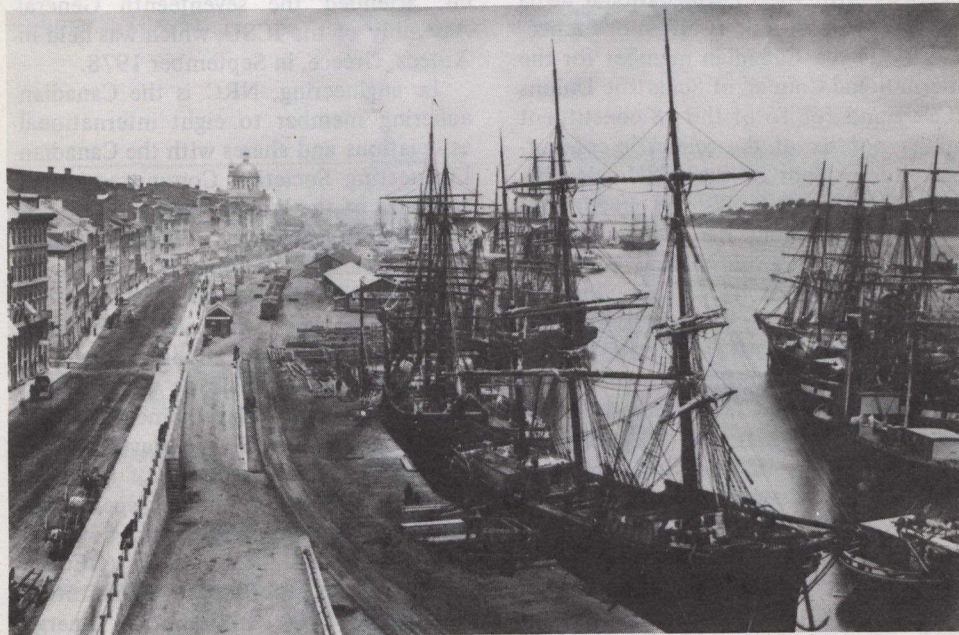
From Custom House, Montreal, Looking E. by William Notman.

Documentary Photography in Canada 1850-1920 , an exhibition of 89 photographs of Canadian views and Canadian portraits, was on view recently at the National Gallery of Canada.