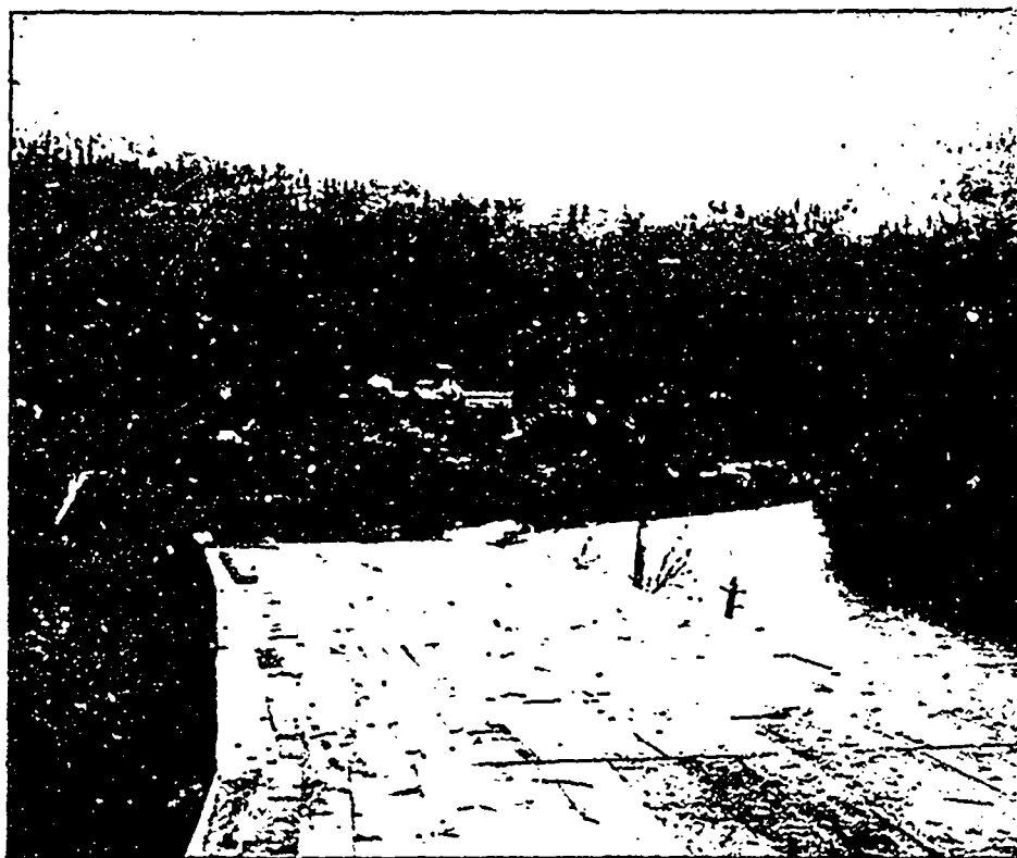
FLUME CONVEYING WATER TO POWER PLANT AT GRANBY SMELTER, GRAND FORKS.