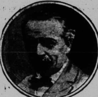
DAVID LLOYD GEORGE