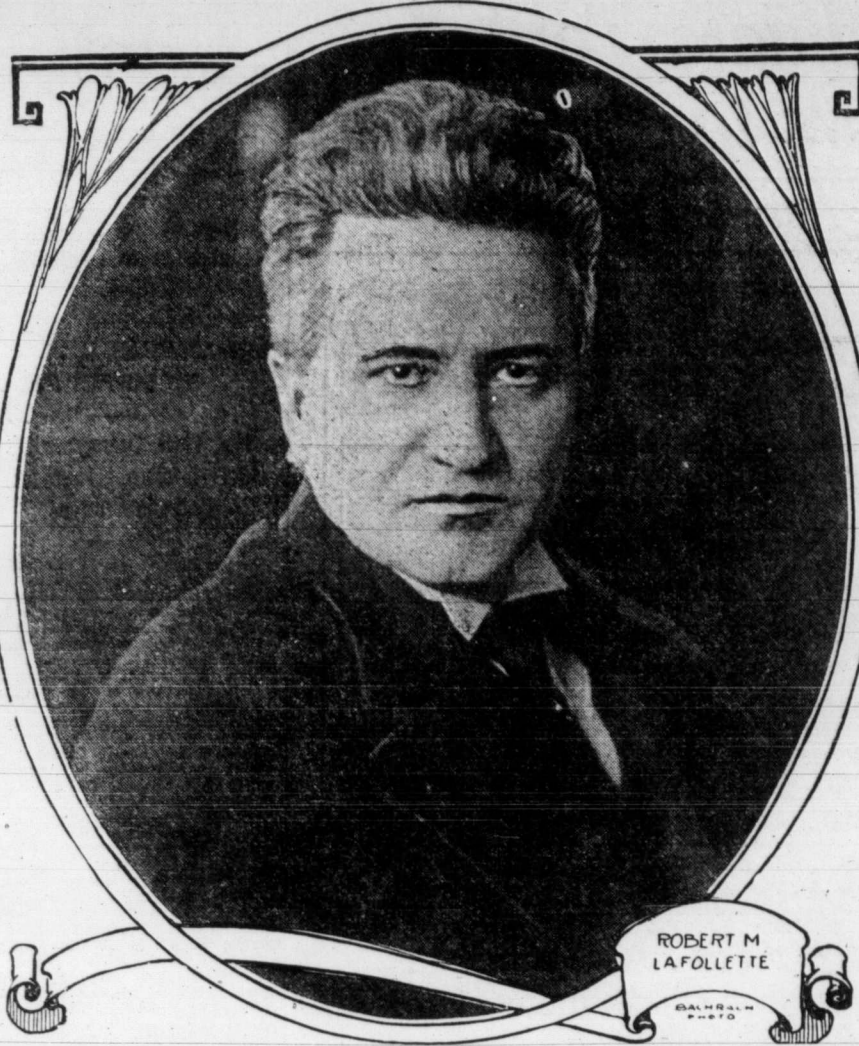
ROBERT M. LAFOLLETTE