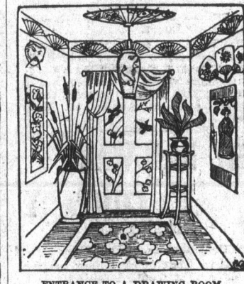
ENTRANCE TO A DRAWING ROOM.

Japanese drapery or an art serge to tone with the other shades should be