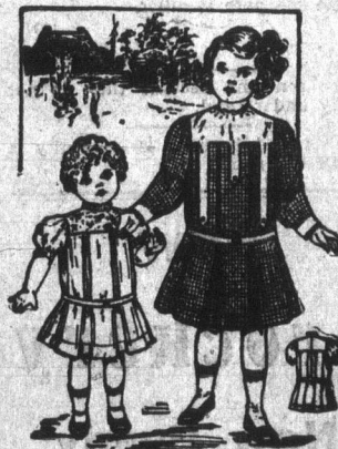
CHILD'S SUMMER FROCK—5630.

Tulle is being used for many of the late spring wedding gowns. Glossy silk crapes, too, have come into the market in great quantities, and they are chosen by some brides. Chiffon cloth is still a standby for brides who are econom-