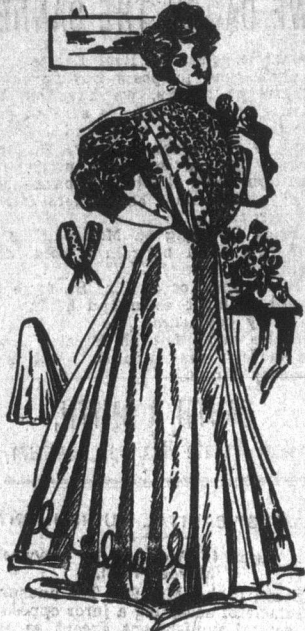
THIS FASHIONABLE PONGEE—5630, 5563.

The foulard ranks with the pongee as an extremely fashionable and thor-