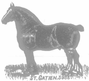
ST. CATIEN, 3988

Bowmanville is on the line of the G. T. R., 40 miles east of Toronto and 294 west of Montreal.