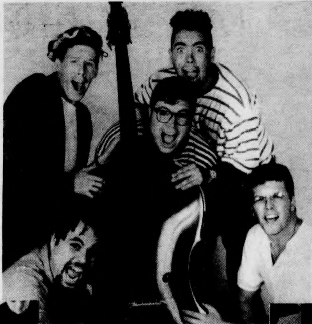
The goofs have landed! Above: The Barenaked Ladies respond to being banned from City Hall. Too Much Joy and King Apparatus are other goofs to watch out for.