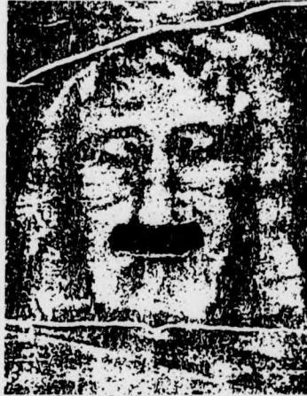
The Shroud of Turpin

Painstaking research and the application of latent photography techniques have finally revealed the truth. The evidence is shown here.