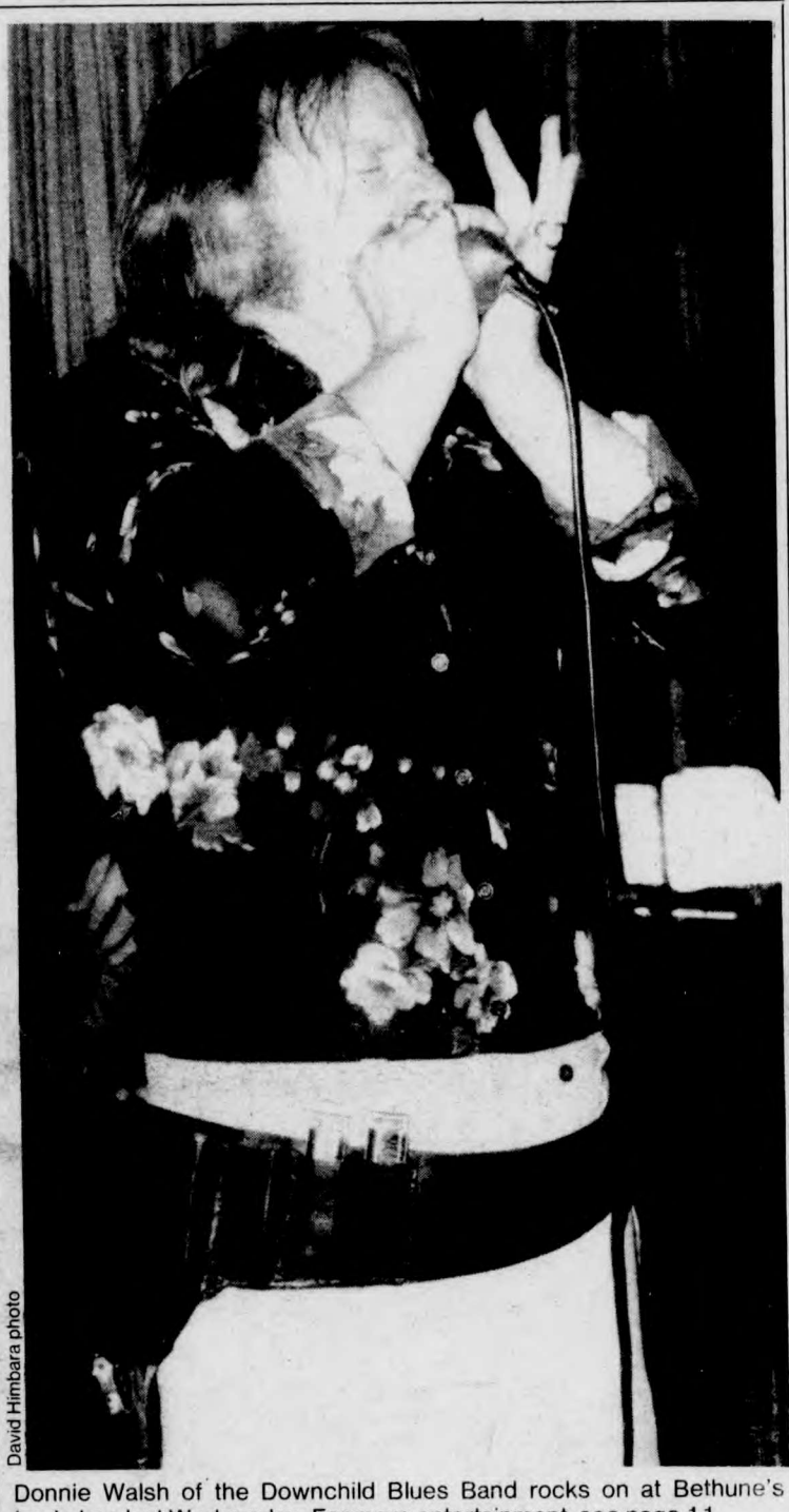
tap 'n keg last Wednesday. For more entertainment, see page 11