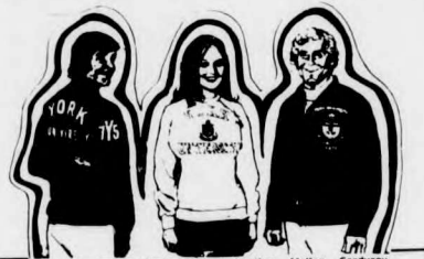
Hundreds of Nylon, Nylon-Leather, Melton, Corduroy, Jackets, Slacks & Sweat & T-Shirts