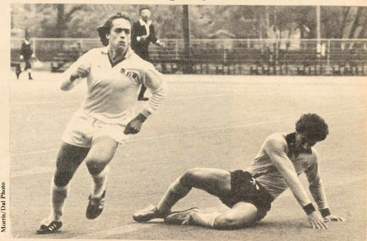
Playoff action last Saturday at SMU. UNB eliminated Dal in overtime 3-2.

UNB now advances to the Eastern final of the CIAU's while Dal closes out its season with exhibition games against the Alumni and the Royal Military College of Canada.