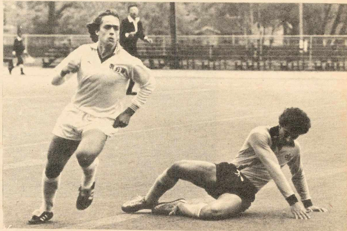
Playoff action last Saturday at SMU. UNB eliminated Dal in overtime 3-2.

UNB now advances to the Eastern final of the CIAU's while Dal closes out its season with exhibition games against the Alumni and the Royal Military College of Canada.