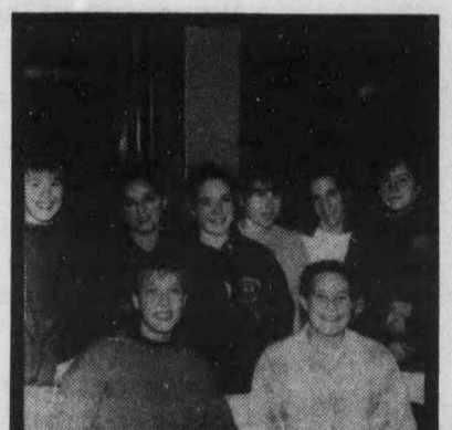
Red Bloomers PEd XXV "We share"