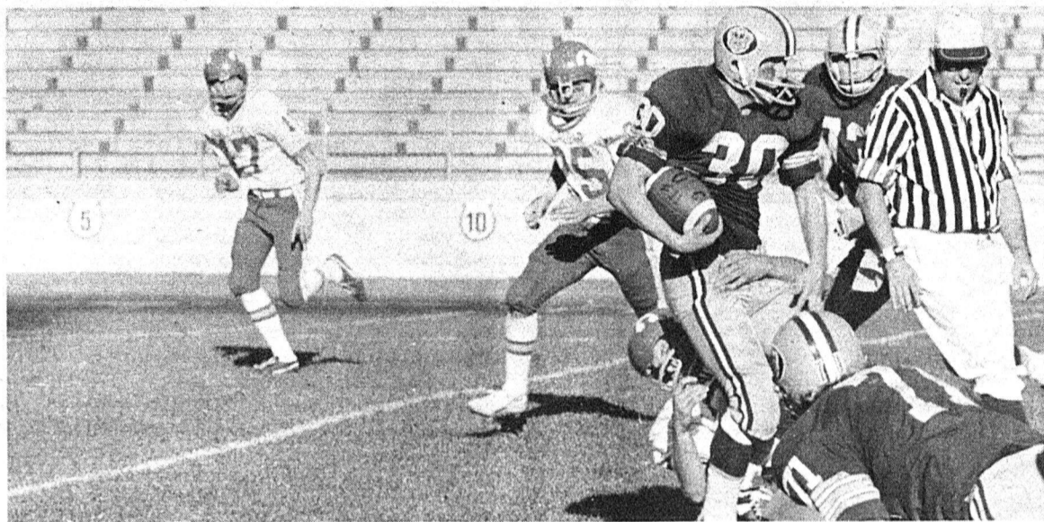
About the only first half offence