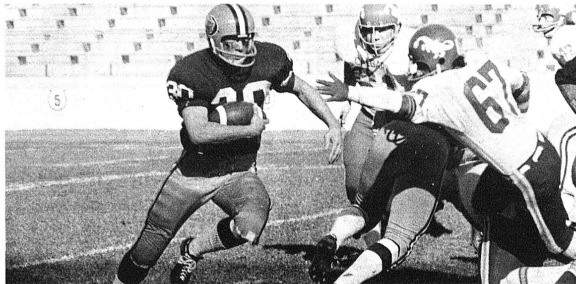
...the Golden Bears possessed