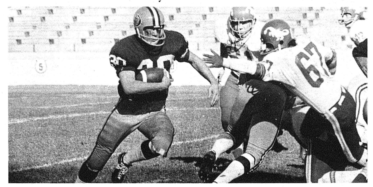
...the Golden Bears possessed