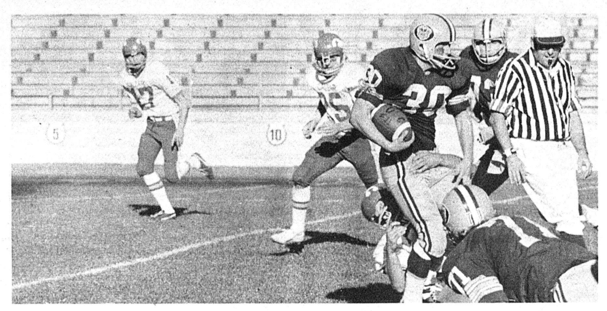
About the only first half offence