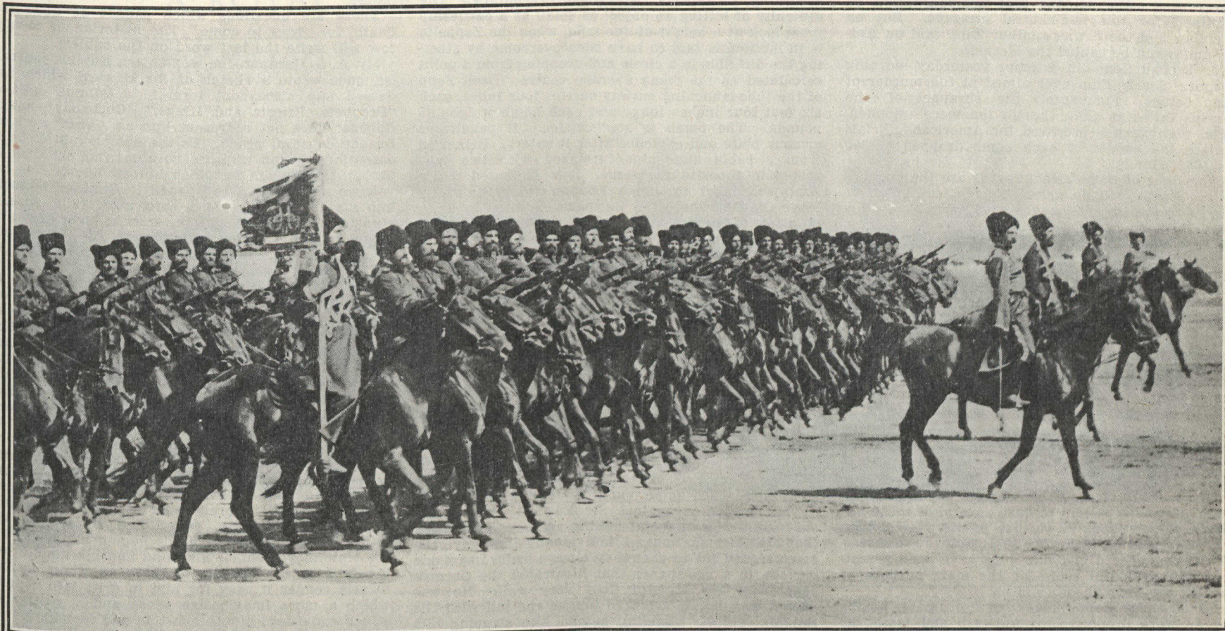
The terrifying Cossacks are now on German soil. They expect to picket their horses on the Unter der Linden, in Berlin; and they seem more likely to do it than the Kaiser's Uhlans are to let their steeds graze on the boulevards of Paris. Russia has 60,000 of these terrible cavalymen.