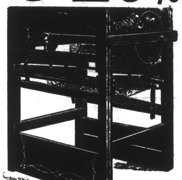
CHATHAM SEPARATOR For separating Oats from Wheat

MENTION THE WESTERN HOME MONTHLY WHEN WRITING ADVERTISERS PLEASE