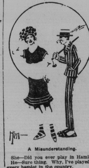
She—Did you ever play in Hamlet? He—Sure thing. Why, I've played in every hamlet in the country.