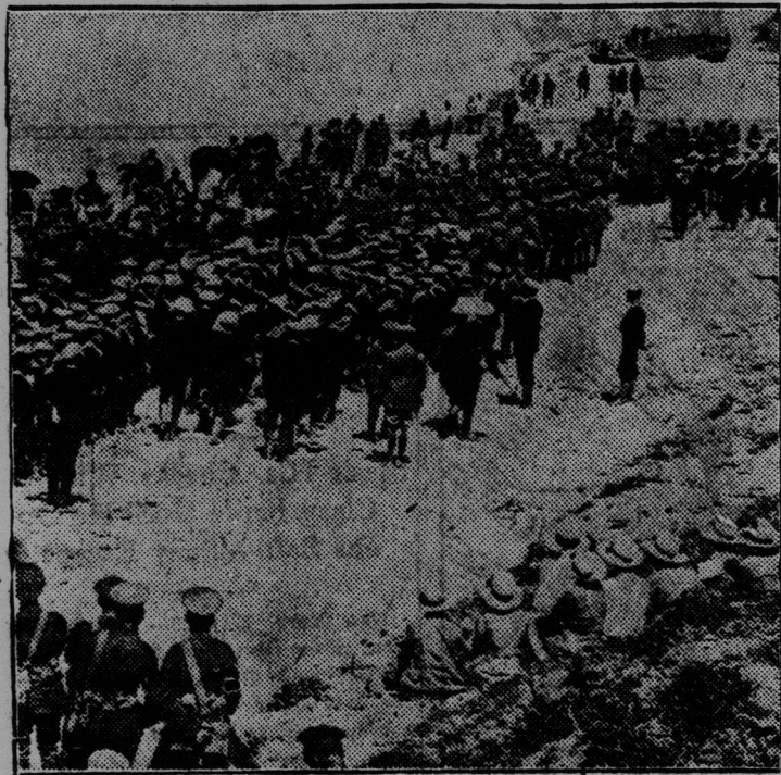
British soldiers, sailors and nurses gathered on the beach between Shrapnel Valley and Hell's Spit on Anzac Day, to commemorate the undying glory of the Australian Troops and New Zealand Troops in their defence of the Dardanelles.

Nurse Testifies Patient was Rolled in Many Layers of Wool and Flannel.